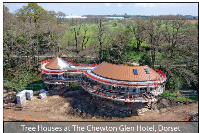
Tree Houses at The Chewton Glen Hotel, Dorset

Whether they reaffirm what you already knew or introduce something different, case studies are a great way of seeing what works in practice to gain insights into how those ideas may assist you in your own daily challenges.