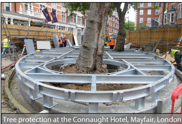
Tree protection at the Connaught Hotel, Mayfair, London

These practical examples of successes and failures will focus on the typical issues that regularly arise when working near trees, including site supervision, tree protection with fencing/ground protection, the installation of hard surfacing, building structures, installing services, raising levels, excavating, planting in structural cells, and removing structures and surfacing.