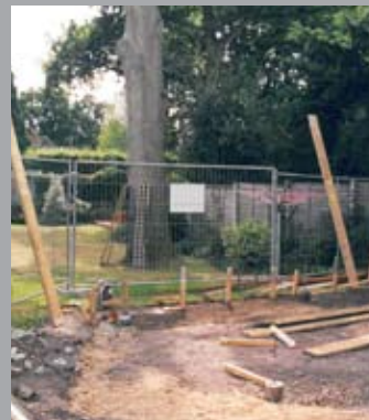
The newly installed piles stick up out of the ground ready for the temporary shuttering that the concrete base will be poured into.