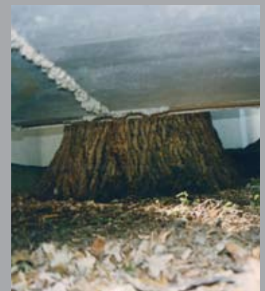
The void beneath the building with its floor supported above the undisturbed soil surface.