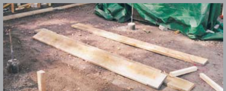
Wooden pegs and boards are the shuttering used to form the temporary side framework for the concrete floor, which will be eventually supported by the piles that can be seen sticking out of the ground.