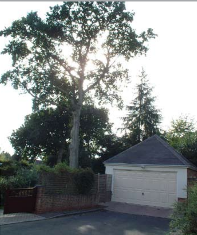
The completed garage and tree in 2002.

With the shuttering in place and the void-former acting as the temporary base, the reinforcing steel links the top of each pile to the main floor ready for pouring the concrete. Note the drain in the foreground that will redirect rainwater from the roof beneath the floor through a pre-installed drainage distribution loop.