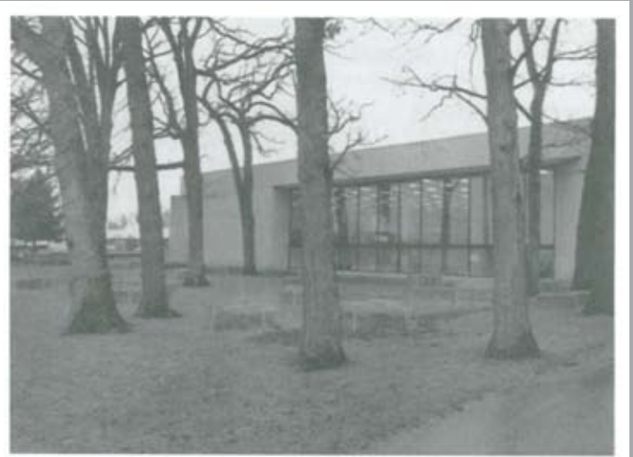
Figure 2. A photo taken prior to construction of the bank addition. The bales of straw are placed where support pillars will be located.

Read the full story of this project from the account published in this ISA book.