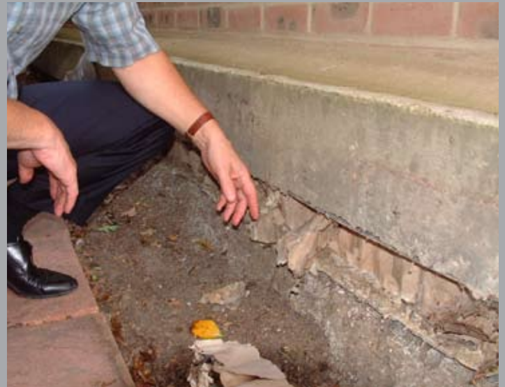
Close up of the floor slab showing the biodegradable void-former layer, resting on the soil surface, which supported the poured concrete of the floor until it had set.