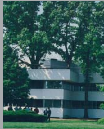
The completed building in 1995 with mature trees within the building footprint.

Extract from the article showing the site before the building extension.