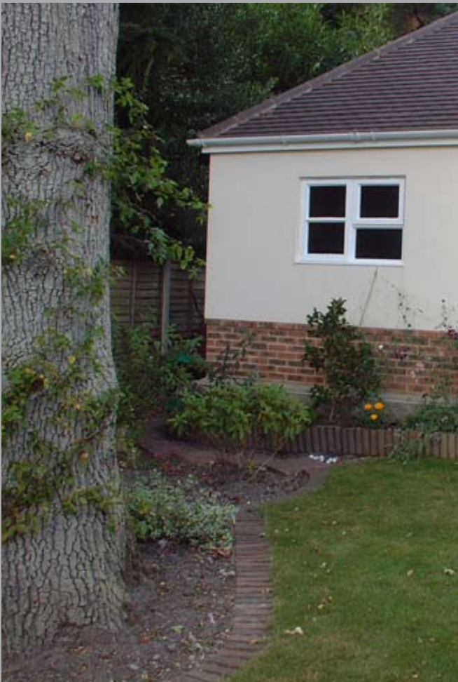
The oak in the foreground with the completed double garage about 4m away.

This property was built in the late 1990s on a heavy clay soil, but without a garage. The soil in the rear garden had been heavily compacted during the construction and the new owner wanted a double garage. The only place to put it was about 4m from a mature oak, which had a root protection area requirement of about 8m. The planning conditions required that remedial work was undertaken to the soil near the tree to improve the rooting environment and that the garage was built on piles to minimise any further disturbance. The new garage was completed in 2002 and the tree is still present with no obvious signs of decline.