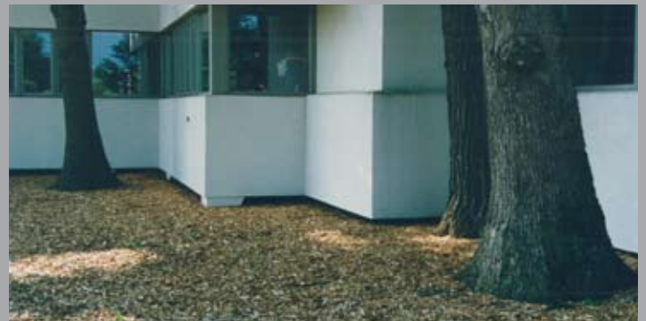
The whole structure is supported above ground level by foundation pads, which caused relatively little damage to roots and the rooting environment.