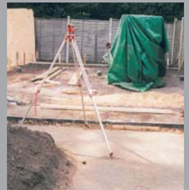
A similar view from the entrance off the public road with the void-former stacked beneath the green sheet ready for use as a temporary floor base.