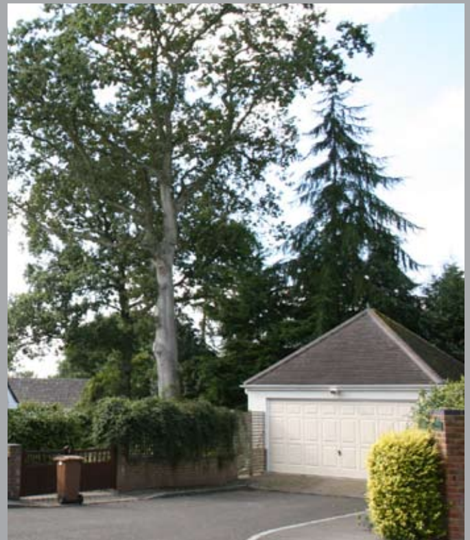
Five years after completion, the tree shows no signs of any adverse impact.